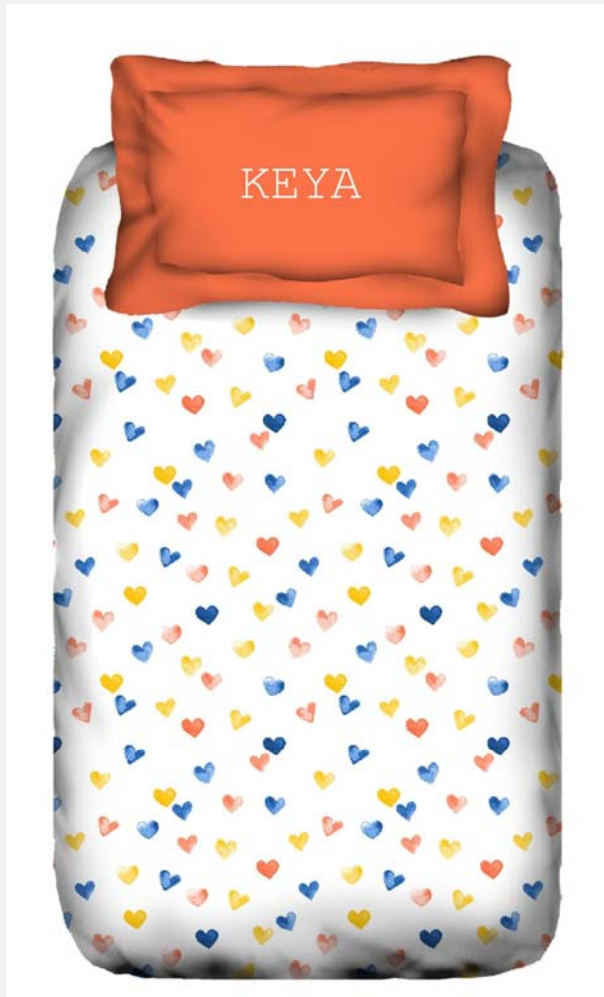
Customized Kids Bedding With Name